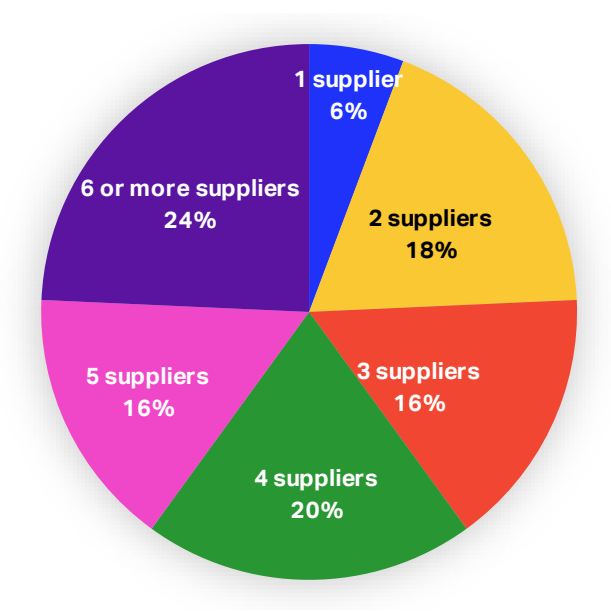
Chart 1: Number of fuel suppliers per airport that are in-scope of RFEUA