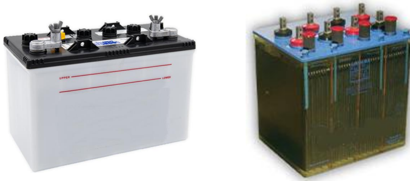
Figure 3 – Example of Spillable Wet Battery

Spillable wet batteries: Consist of a series of metal plates immersed in an electrolyte. The electrolyte is a corrosive liquid such as dilute sulphuric acid. Spillable batteries will leak the corrosive electrolyte if not maintained in an upright condition throughout transport, including loading and unloading.