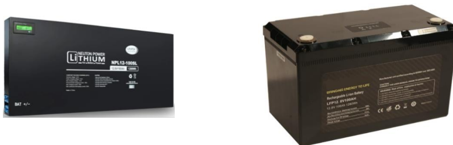
Figure 1 – Examples of Lithium Ion Batteries

Lithium-ion batteries (sometimes abbreviated Li-ion batteries): A secondary (rechargeable) battery where the lithium is only present in an ionic form in the electrolyte. Also included within the category of lithium-ion batteries are lithium polymer batteries. Lithium-ion batteries are generally used to power devices such as mobile telephones, laptop computers, tablets, power tools and e-bikes.