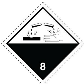
Figure 4 – Corrosive label