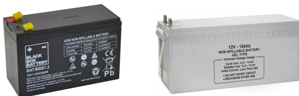
Figure 2 – Examples of Non-Spillable Wet Batteries

Non-spillable wet batteries: Have an absorbed electrolyte (absorbed glass mat (AGM), gel battery, gel cell, sealed lead-acid (SLS), dry and dry cell) and do not leak any electrolyte or liquid even if the battery case is ruptured or cracked. The batteries must be capable of passing certain vibration and pressure differential tests.